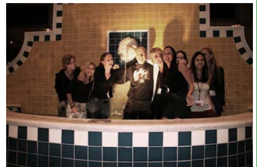
Members of the Marine Mammal Center in Sausalito enjoy the décor at the Coronado Resort.