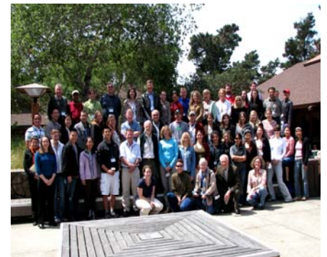
2007 CL Davis W Coast Attendees.

The 25th Annual West Coast Subdivision Meeting has already been scheduled for Friday and Saturday, April 25th and 26th, 2008 at Asilomar Conference Grounds. Please mark your calendars!