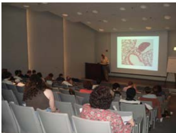
Attendees at the 2007 meeting in Chicago

Every April, the Foundation conducts the Annual Symposium on Laboratory Animal Medicine at the University of Illinois at Chicago. We have held this symposium for the last 14 years to help support veterinarians who are studying to become boarded with the American College of Laboratory Animal Medicine (ACLAM). This 4-day Symposium is comprised of a self-study, formal seminars, and Saturday Continuing Education Seminar that is given by national expert on a given topic.