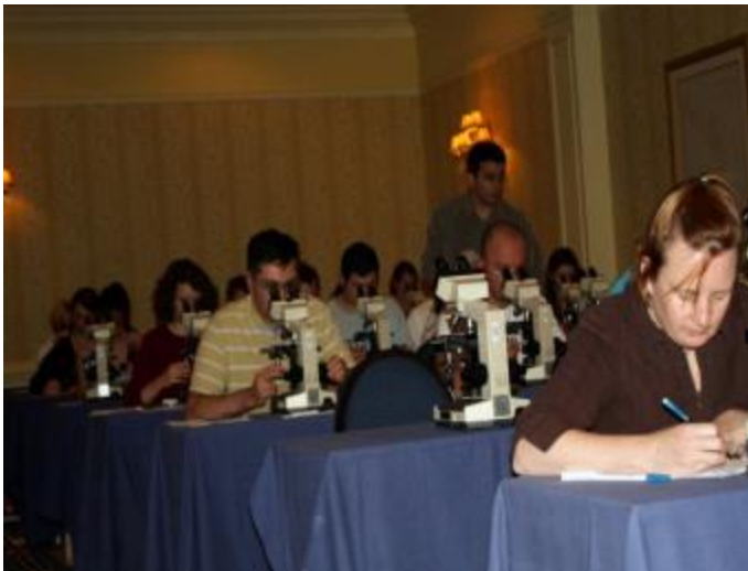
The concentration is always palpable in the scope room at testing time.